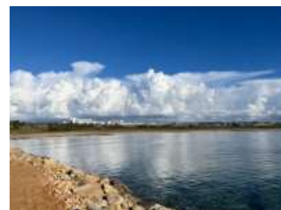
View of the Mediterranean Sea from the resort in Cyprus