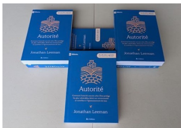
One of the books recently printed at Sola Publishing